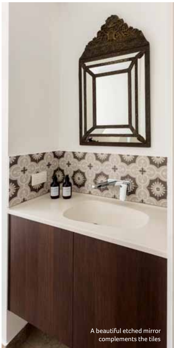
A beautiful etched mirror complements the tiles