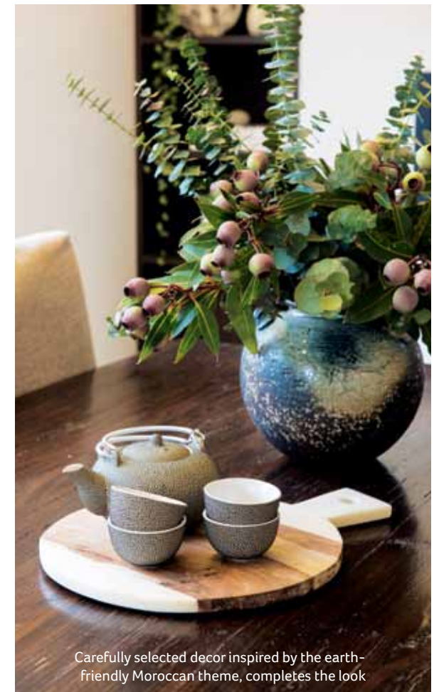
Carefully selected decor inspired by the earth-friendly Moroccan theme, completes the look

In the new build, many low-environmental-impact building materials were used in keeping with the couple's sustainability tenet. It has high-efficiency glazing, insulation, draft proofing and ceiling fans. It's built on a thermal mass concrete slab and boasts solar hot water and high-efficiency LED lighting. The home electrical energy requirement is supplied by a 4.25kW rooftop PV array, it has heat recovery ventilation HRV, and Haymes low-VOC paints were used throughout.