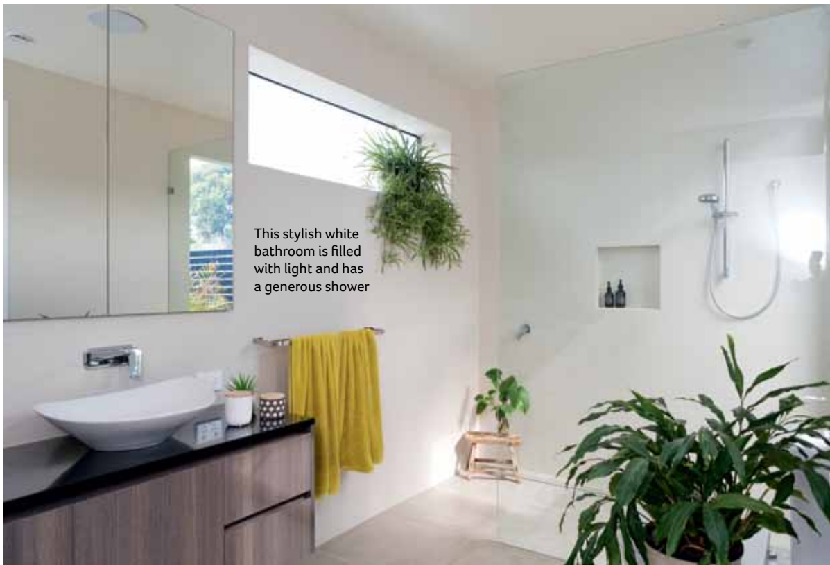
This stylish white bathroom is filled with light and has a generous shower